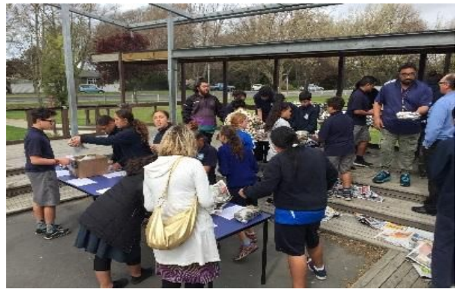
Te Tahu Rua Reo serving hangi to students, parents, and teachers. They did a terrific job. Ka pai!